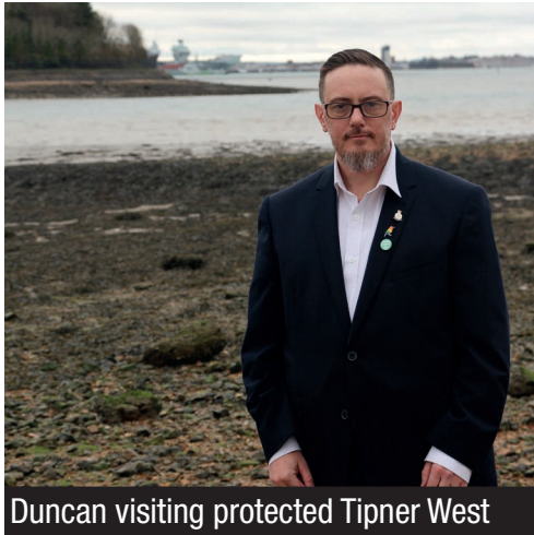
Duncan visiting protected Tipner West

HOUSING AND AQUIND THREATEN OUR REMAINING WILD AREAS